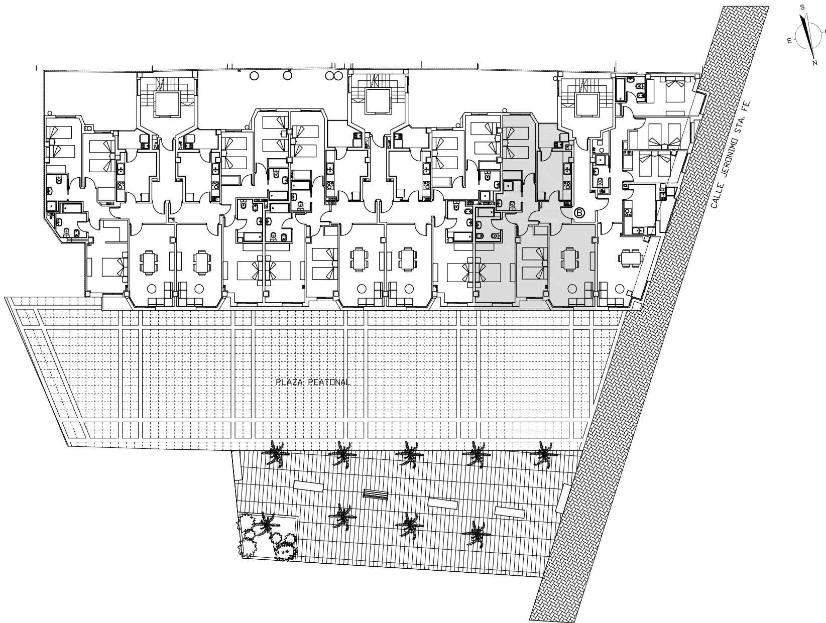
LOCALIZACION VIVIENDAS TIPO "B"